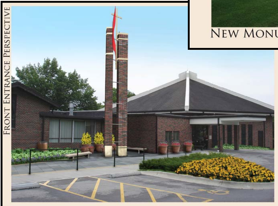
FRONT ENTRANCE PERSPECTIVE