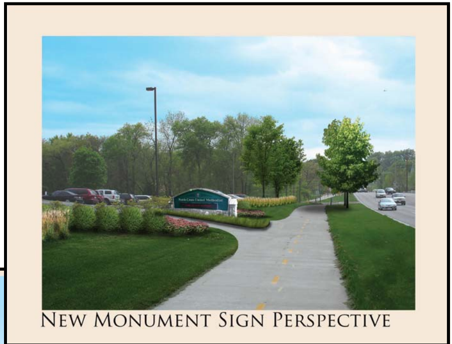
NEW MONUMENT SIGN PERSPECTIVE

Full-sized color images are currently on display in the Narthex.