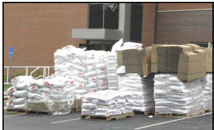
Part of the rice which was packaged into 300,000 meals to be sent to Haiti.