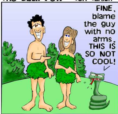
THE FALL & THE BLAME GAME Gen 3:12-13 Leaving the serpent without a 'leg' to stand on.

A couple of cartoons to go along with Neil's sermon Sunday - A Biography of Satan